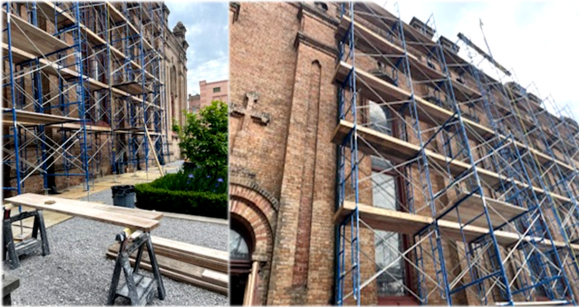
PHASE I - EXTERIOR Restorations are underway