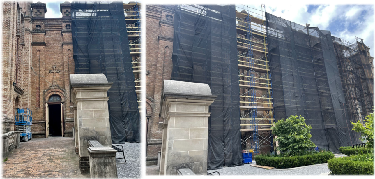
PHASE I - EXTERIOR Restorations are underway! (Above pictures: taken April 28, 2024)