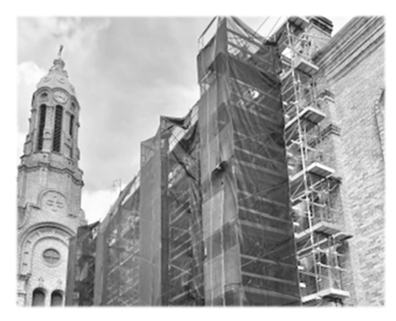
PHASE I - EXTERIOR Restorations are almost complete!