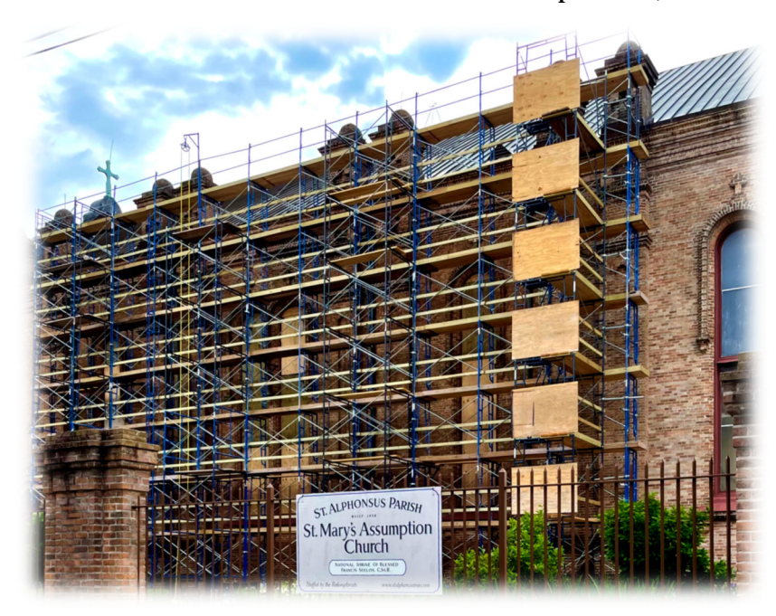
PHASE I - EXTERIOR Renovations (on the Constance Street side are almost complete!)