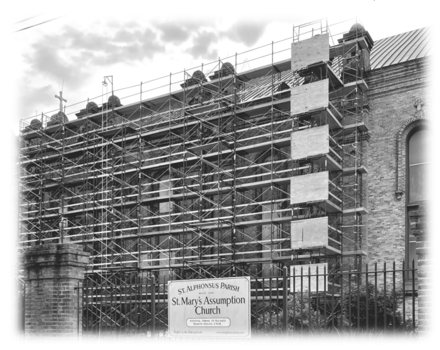
PHASE I - EXTERIOR Renovations (on the Constance Street side of church are almost complete!)