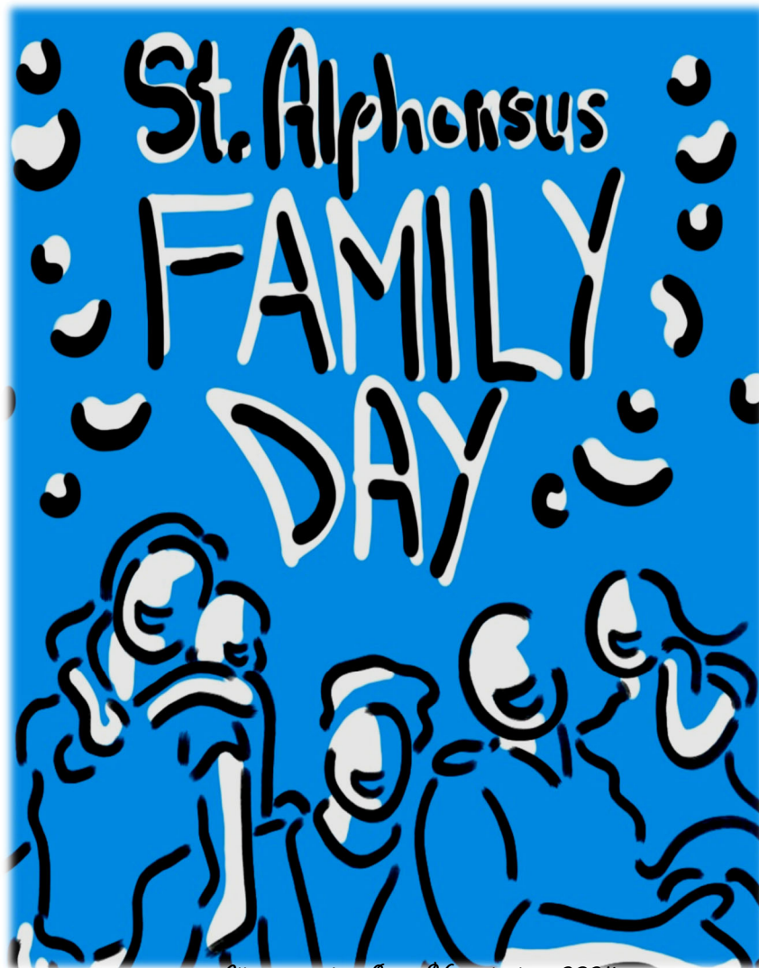
Illustration by: Lora Nigginbotham 2024