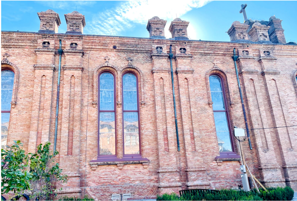
PHASE I - EXTERIOR Renovations (Constance St. side is complete! (picture taken: Dec. 5, 2024)