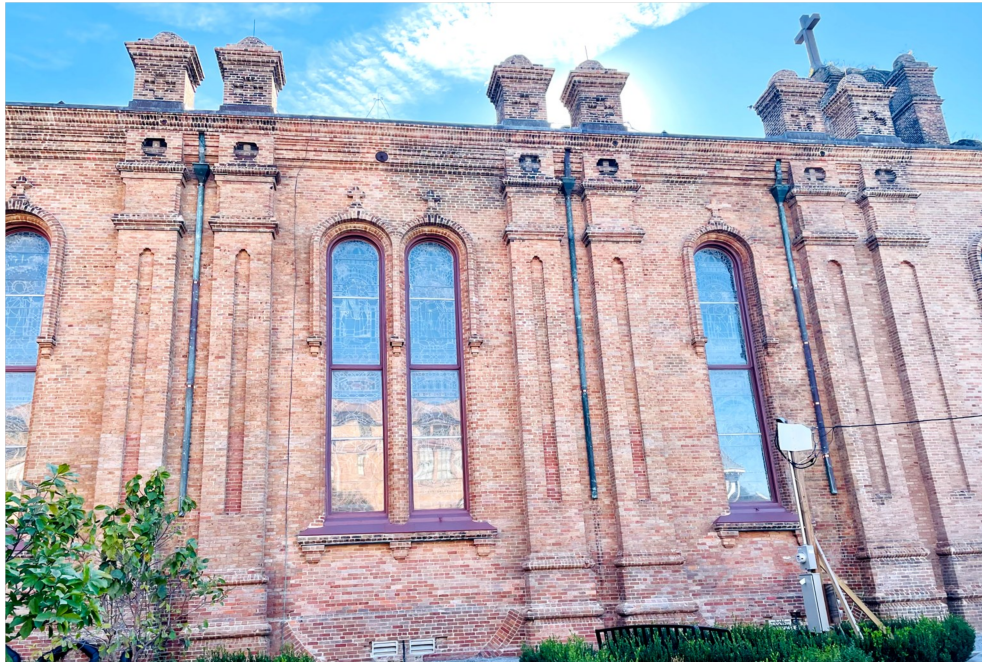
PHASE I - EXTERIOR Renovations (Constance St. side is complete! (picture taken: Dec. 5, 2024)