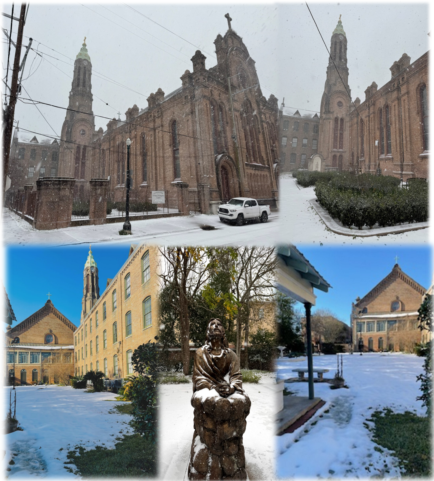
St. Mary's Assumption Church and courtyard after the snowfall!