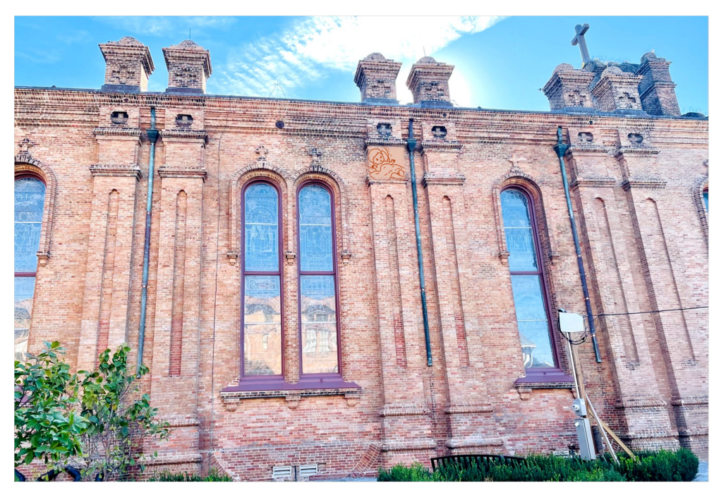
PHASE I - EXTERIOR Renovations (Constance St. side is complete! (picture taken: Dec. 5, 2024)