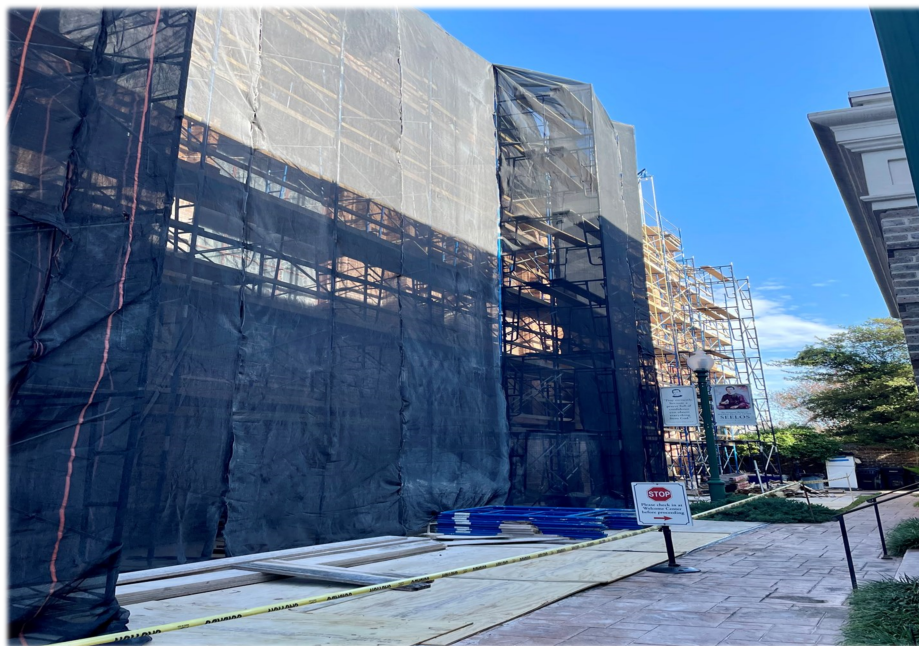
PHASE I - EXTERIOR Renovations are underway (on the riverside of the Church) (picture taken: Dec. 14, 2024)