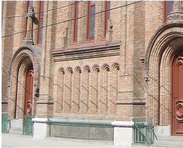
Front of Church is completely restored!

The Front of the Church is completely restored!